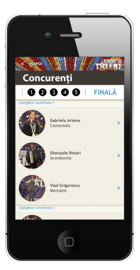
Romania's Got Talent app available on iOS/Android smartphones and tablets Romanii au Talent – published by CME